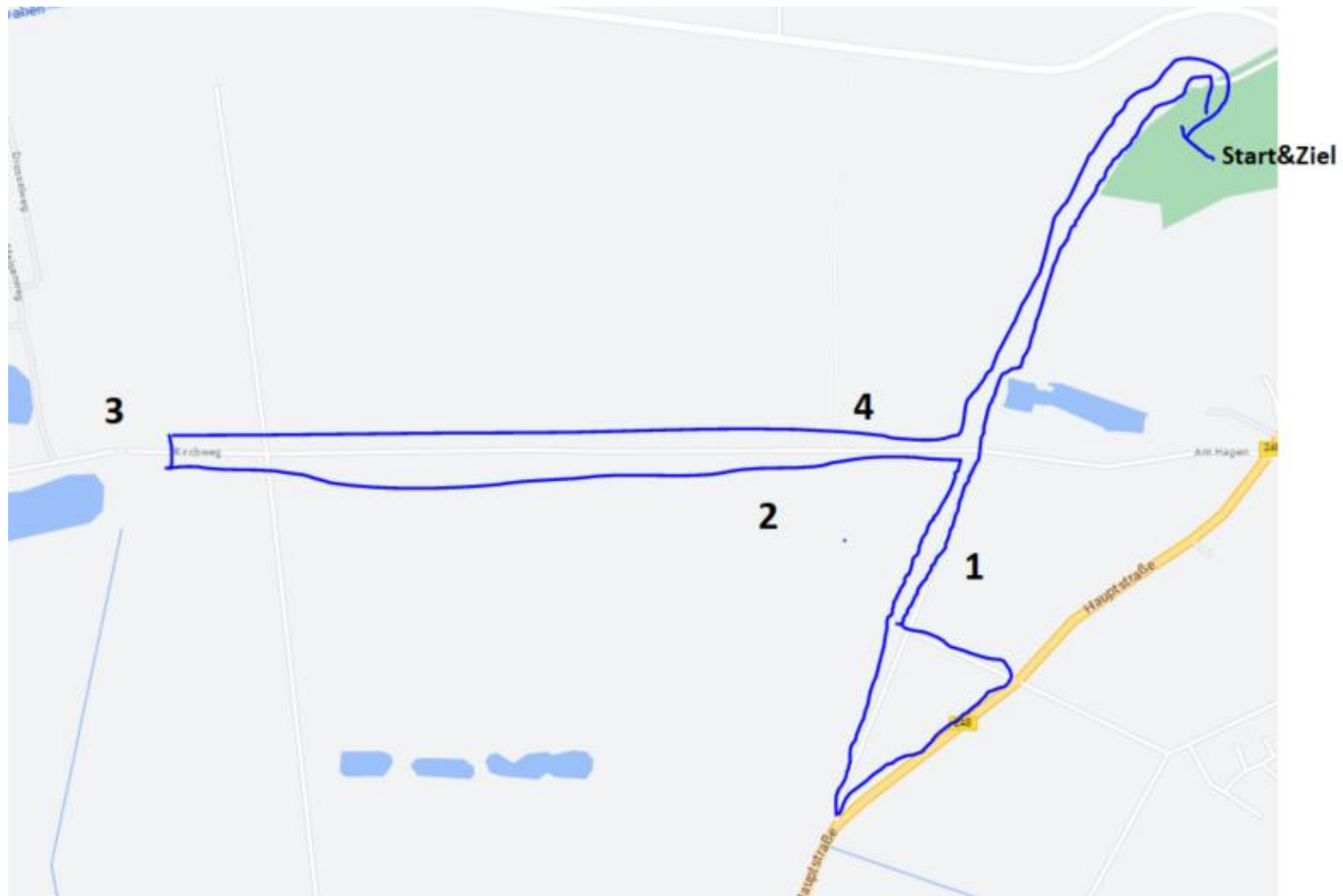
Laufstrecke 5 km (Wendepunktstrecke)